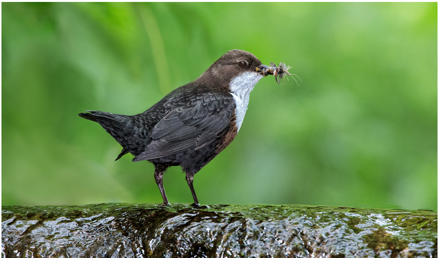
“Dipper with Grubs” by Sandy Cleland

Following is a small selection of Sandy's images.