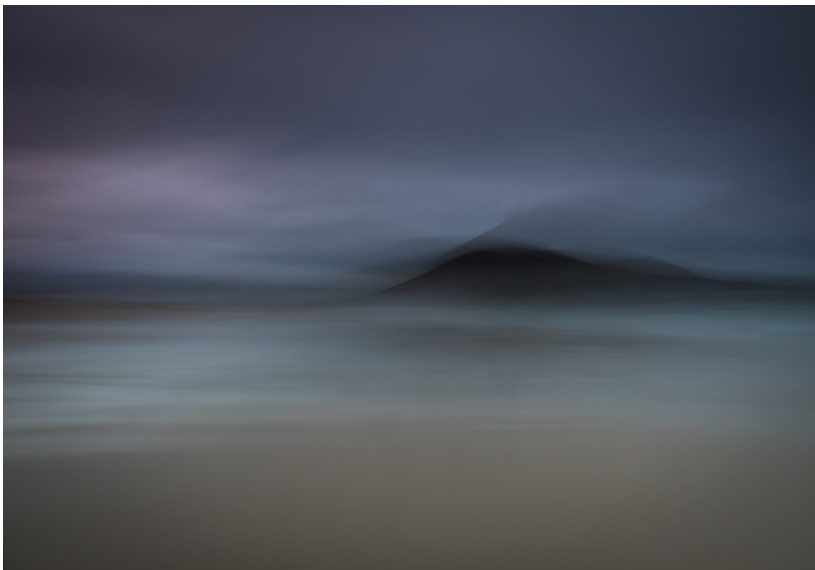
“Bathed in Light” by Muriel Binnie, The EPS Trophy