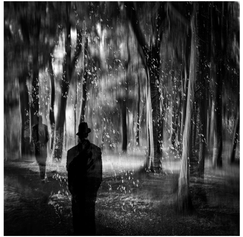
“A Walk in the Woods” by Ian McNaught LRPS The Edinburgh Cameras Cup