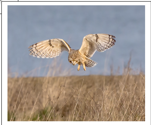
“Short-eared Owl Hunting” by Sandy Cleland